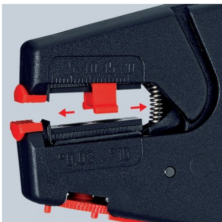
12 40 200: Adjustable length stop