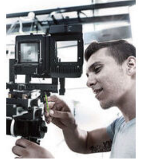
Holding function for recessed TORX® screws