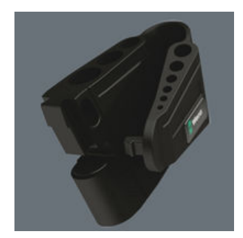
The wear-resistant clip material ensures that the L-keys are securely held yet are easy to remove.