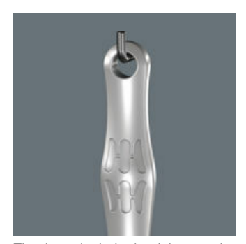
Thanks to its hole the Joker can be neatly hung on the workshop wall.