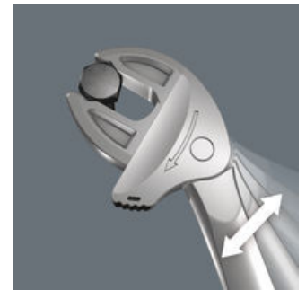
Joker 6004: Ratchet mechanism for fast work

The ratchet function in the mouth sees to fast and consistent screwdriving without removing the tool.