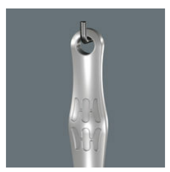
Thanks to its hole the Joker can be neatly hung on the workshop wall.