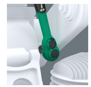
With its extremely slim design, the Zyklop Comfort ratchet allows easy working even in very confined spaces.